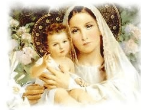
Month of Mary