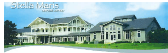
STELLA MARRIS RETREAT CENTER 981 Ocean Ave., Elberon, NJ (732) 229-0602

New Year Bonus Weekend: Reclaiming Time to Think and Pray January 6-8, Friday 5:30 p.m. to Sunday (after dinner) $100.00