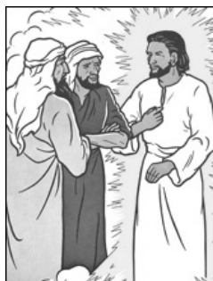
TRANSFIGURATION OF THE LORD